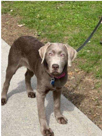
Luna, the Watertown Police Department's new therapy dog, is home after four weeks of training. After a two-week break, she heads back to school for three more weeks of training. Once she graduates, she'll officially be on the job!