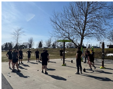
Recruits participated in physical fitness Training at Thompson Park