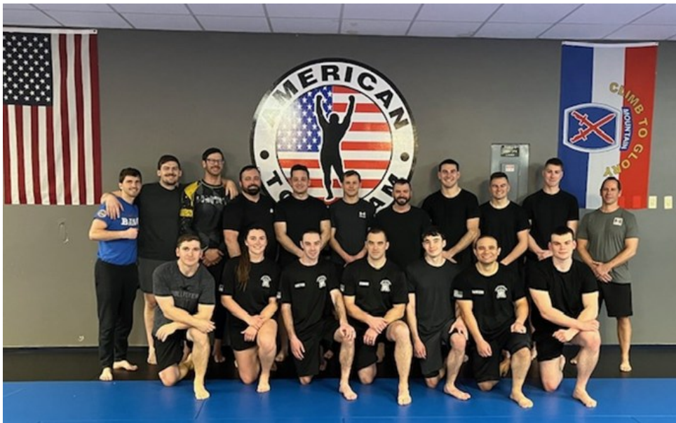
The recruit class took a break from defensive tactics training to pose for a photo.

The Black River/St. Lawrence Police Academy Class of 2024-2025 has completed the classroom portion of the Basic Course for Police Officers. The academy recruits transitioned into the “Field Training” portion of the police academy. They will spend the next 13 weeks working on the road with several Field Training Officers (FTOs). Their responsibilities will gradually increase over the course of the program until they are handling calls on their own. Success in the FTO program will lead to graduation from the police academy and NY State Certification.