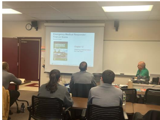
Police academy recruits participate in "First Responder" training at Jefferson Community College.

The 2023-2024 session of the Black River/St. Lawrence Valley Police Academy is now in week eleven. Over the past two weeks, recruits have been training in: stop, question & frisk, defensive tactics, accusatory instruments, report writing, domestic violence and the NY State First Responder course.