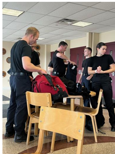
Recruit Officers getting fitted for uniforms.