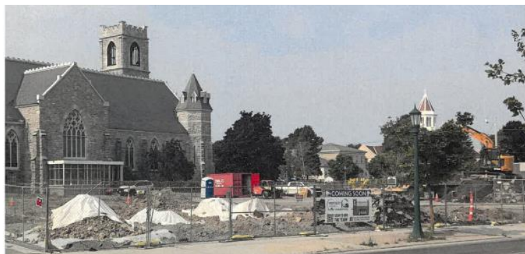
540 State St Taco Bell