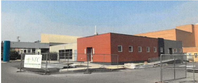
North Country Family Health Center 238 Arsenal Street

850 Arsenal St. – Saint Anthony's Pavilion- New Building (rebuild after fire) 830 Washington St.- Samaritan Medical Center ENT – Renovation Project 170 Court St.-Banquet Hall