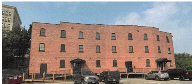
259 JB Wise Place Commercial & Apartments